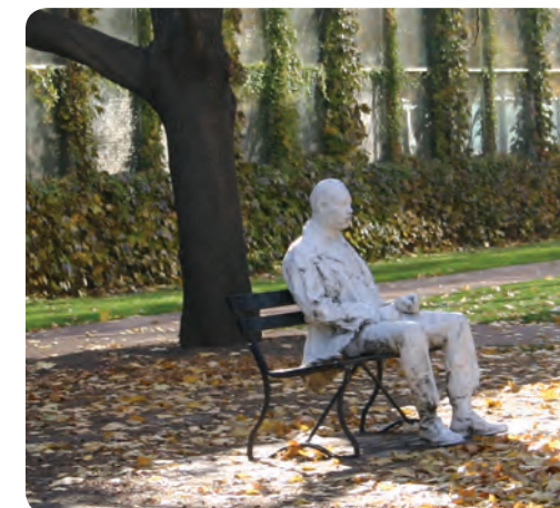
Man on a Bench Park